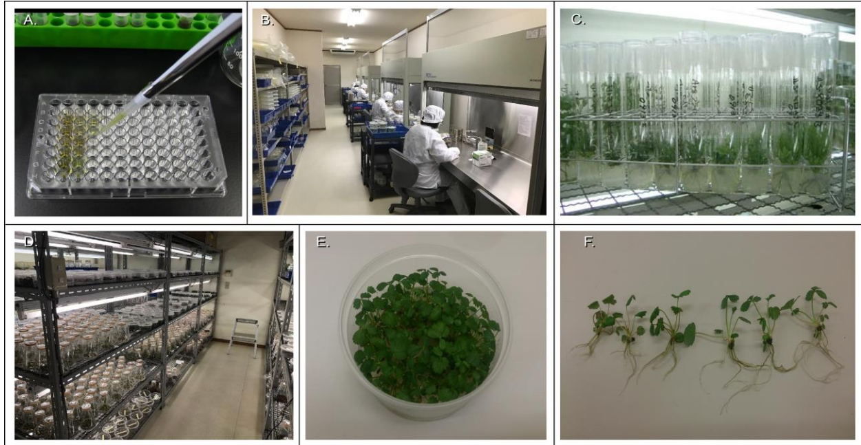
Figure 2. Research and development at Hakusan. (A) Elisa test; (B) Clean tissue culture room; (C) Clean stock plants in tissue culture; (D) TC growth room; (E) Multiplication stage cultures; (F) individual microcuttings.

development of a mass propagation system, and new and improved breeding techniques (Fig. 2).